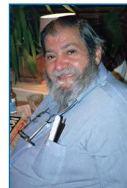
Sir Eddie Kulukundis